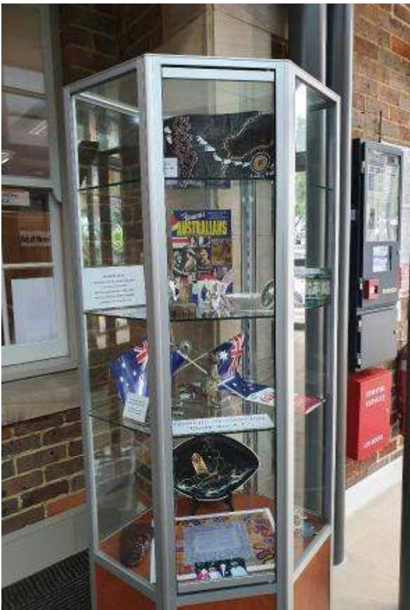
Celebrating Australia Day 2020