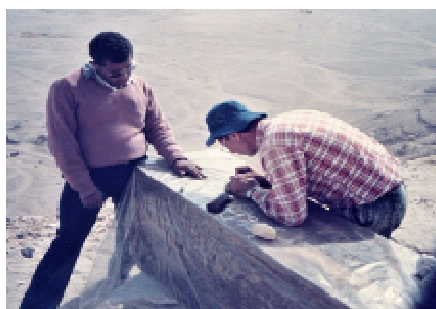
Tracing the inscriptions on a coffin